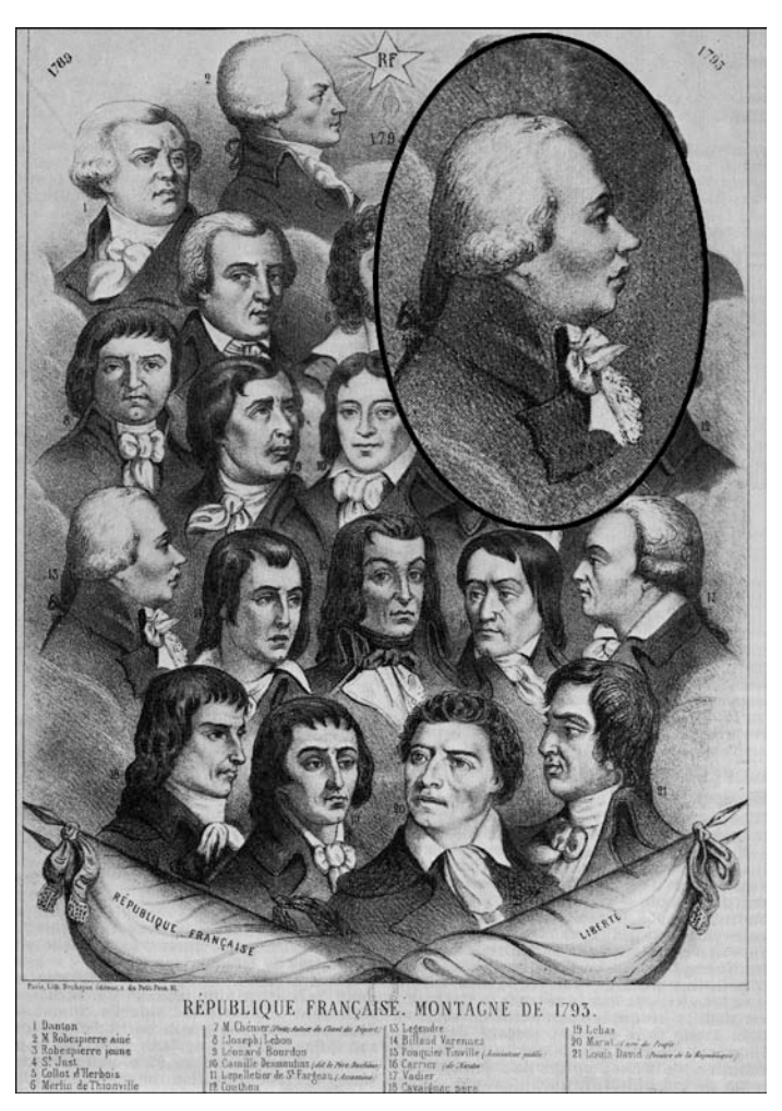
Figure 2. L. Legendre pictured with Montagnards (lower left and inset).

Louis Legendre (ca. 1755–1797) was a butcher in Paris when the Revolution broke out in 1789. (His year of birth is variously recorded as 1752 [4], 1755 [8], and 1756 [2].) He participated in the storming of the Bastille and subsequent revolutionary events, and was elected a deputy